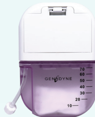
UNO Canister 70 mL