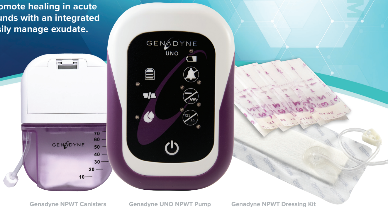
Genadyne NPWT Canisters

The Genadyne UNO Negative Pressure Wound Therapy (NPWT) Pump is a single-use, rechargeable NPWT device designed for low- to moderate-severity wounds. The system uses a vacuum dressing to promote healing in acute or chronic wounds with an integrated canister to easily manage exudate.